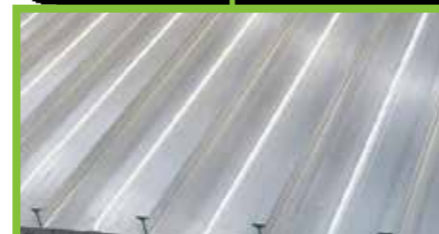
Stiffened Shell Plate