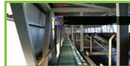
Anti-Slip Aluminium Net